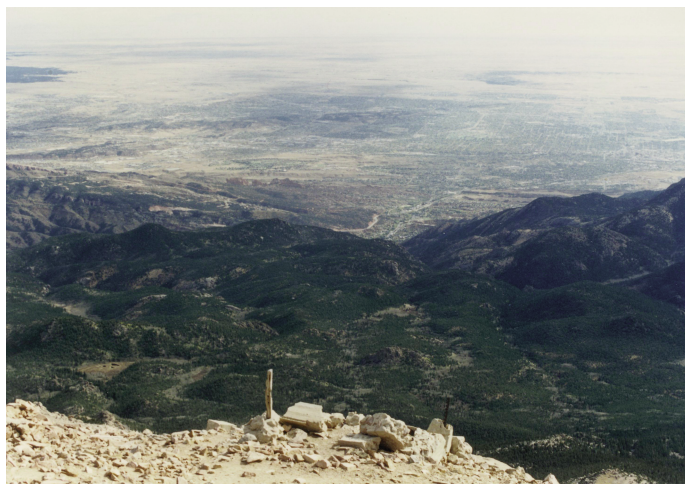
A view of Colorado Springs from the summit of Pikes Peak.